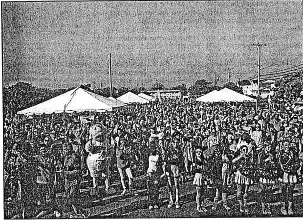
The 2024 Walk to Fight Alzheimer's drew a huge crowd of walkers — over 750 participants — to the seaside streets of Point Pleasant Beach.